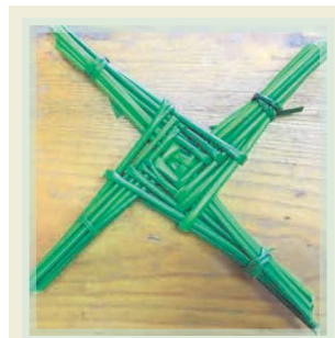
St. Brigid's cross

I was once called to the bedside of a dying pagan chief to speak to him about God and Christ's love for mankind. To illustrate the point, I picked up some of the reeds covering the dirt floor and wove them into a cross to help him understand how Christ died for us.